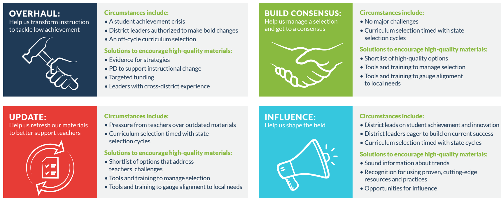
Figure 2. The four jobs that shape curriculum selection

Lastly, districts with this job will also value the solutions that appeal to Build Consensus districts. Because their formal selection process parallels the process in Build Consensus districts, they also value solutions that help them manage the selection process and gauge alignment with local context.