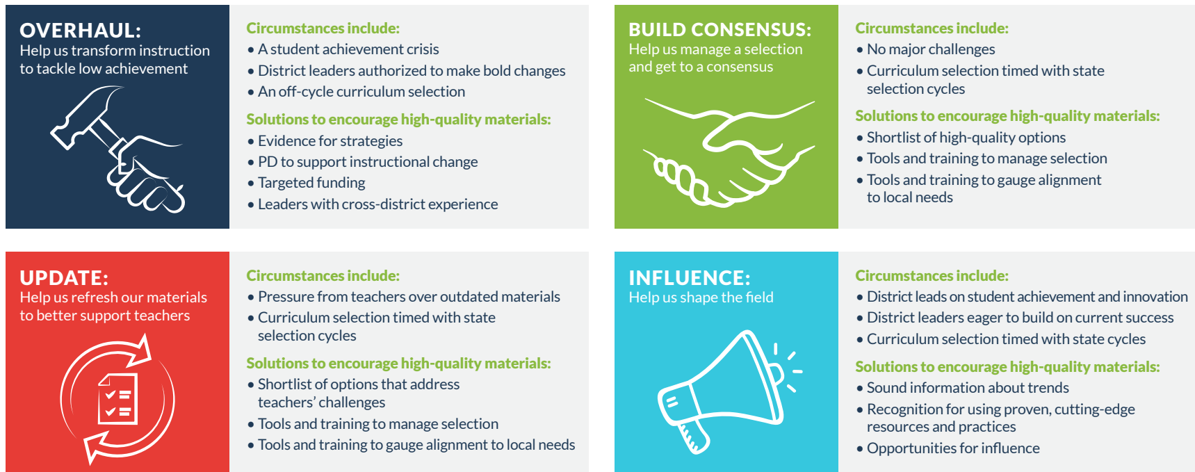
Figure 2. The four jobs that shape curriculum selection

Lastly, districts with this job will also value the solutions that appeal to Build Consensus districts. Because their formal selection process parallels the process in Build Consensus districts, they also value solutions that help them manage the selection process and gauge alignment with local context.